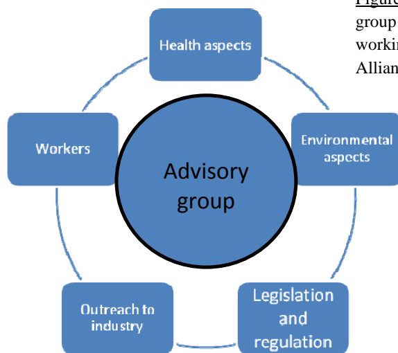
Figure 2: Structure of Advisory group and thematic focal area working groups for the Global Alliance

23. The Global Alliance is not an institutional entity but a collaborative initiative. As such an operational framework has been prepared by UNEP and WHO to describe the working arrangements of the Global Alliance including the role of the advisory group, the five focal area working groups and to provide guidance on public communication, the rights and responsibilities of contributors and guidance on financial matters.